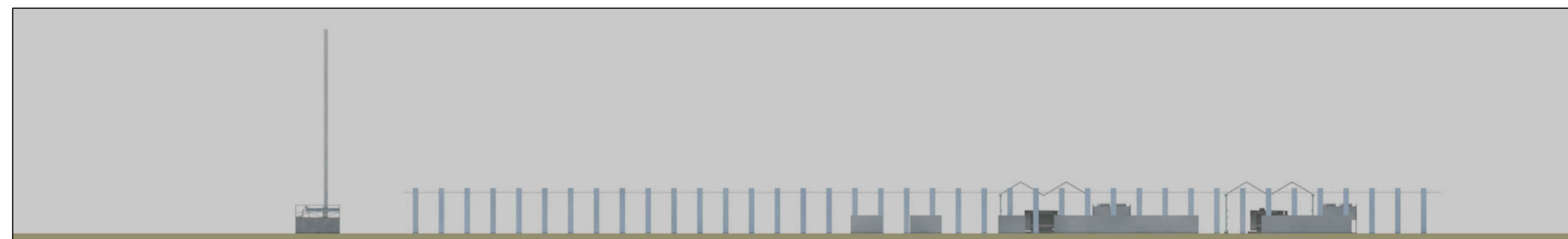
ELEVATION LOOKING SOUTH Scale 1:1000