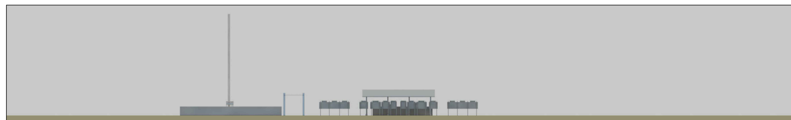
ELEVATION LOOKING EAST Scale 1:1000