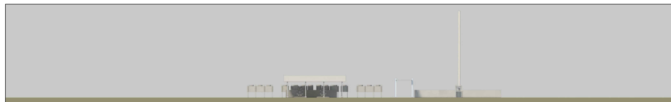
ELEVATION LOOKING WEST Scale 1:1000